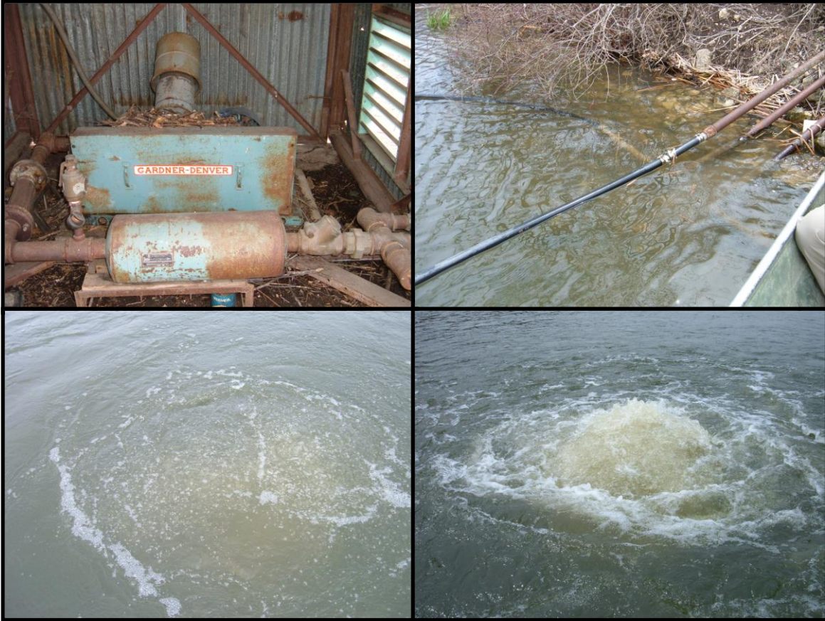
Figure 2. Pictures of destratification unit (top left); pipes to diffusers (top right); surface above two functioning Helixor diffusers (bottom).