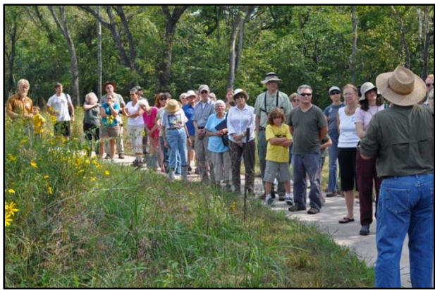
Fall tour at the Rockefeller Native Prairie.