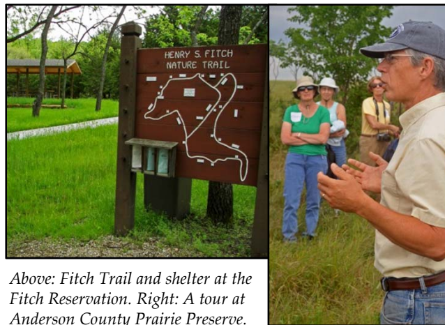
Above: Fitch Trail and shelter at the Fitch Reservation. Right: A tour at Anderson County Prairie Preserve.

More information and trail maps: biosurvey.ku.edu/field-station