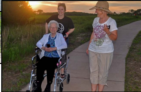
The ADA-compliant Rockefeller Prairie Trail welcomes people of all ages and abilities to the Field Station. This half-mile out-and-back trail ends at the Kaw River Valley Overlook deck (far right panel), built by KU architecture students and featuring a view of Mount Oread in the distance.